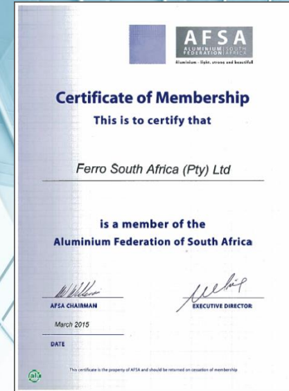
AFSA Certificate of Membership